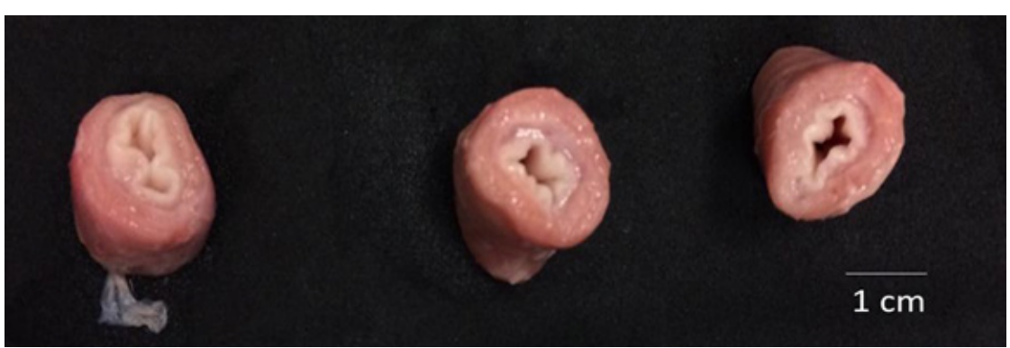
Figure 1 – Samples before decellularization protocol.

The samples used in the decellularization protocol were previously photographed for analysing the macroscopic aspect, as it is shown in the figure 1.